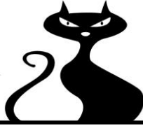
un chat noir

Let's learn the French words for these scary Halloween items