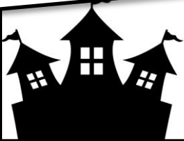
une maison hantée